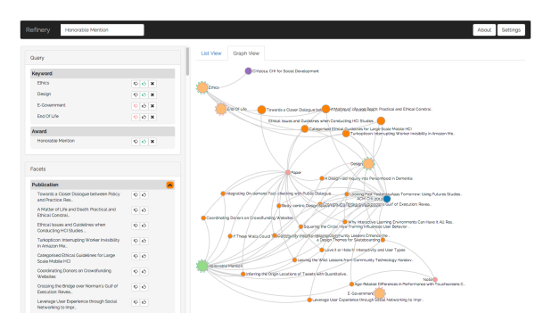
Figure 3: Refinery's Graph View clearly displays items most relevant to the query along with their relationships.

Guidelines for Large Scale Mobile HCI and reads the abstract. This isn't the paper she is looking for, but it is very similar, so she adds it to her query in order to attract related content. Doing so causes the Session CHI2013: Ethics in HCI to appear, which she also adds to the query.