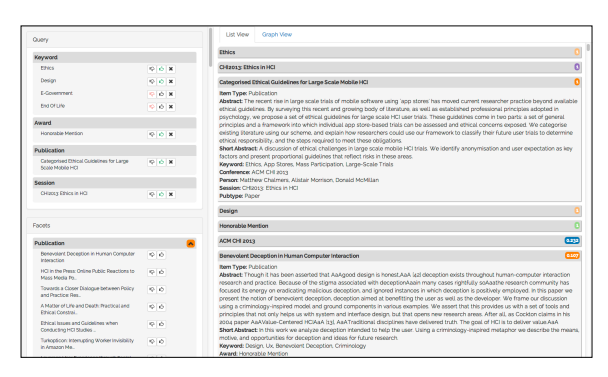
Figure 4: Refinery's List View ranks items by overall rele vance. Users can easily hide or show particular types using toggles in the Sidebar.

© 2015 The Author(s) Computer Graphics Forum © 2015 The Eurographics Association and John Wiley & Sons Ltd